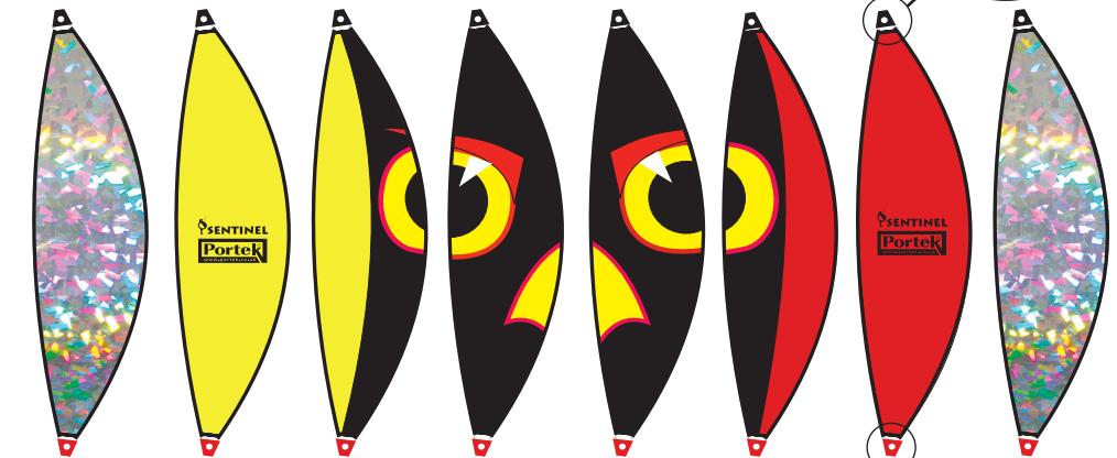
Sequence and layout of vanes